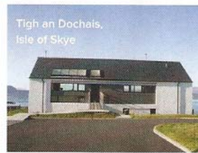
Tigh an Dochais, Isle of Skye