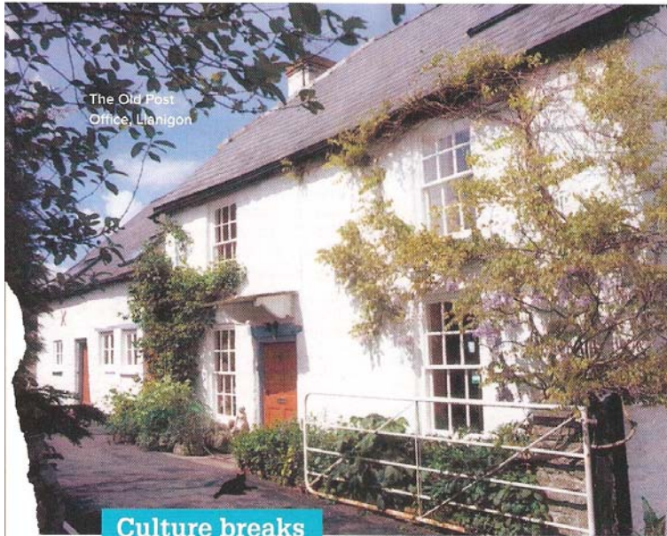
The Old Post Office, Llanigon